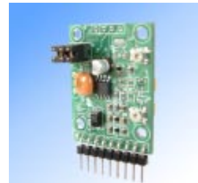
Plug - in Vertical