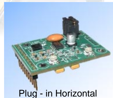
Plug - in Horizontal