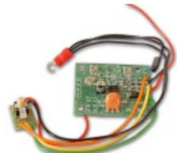
Single button control

PO Box 136, Bexhill on Sea East Sussex, TN39 3WD Tel: +44 (0)870 2407258 Fax: +44 (0) 870 2407259 sales@bhi-ltd.co.uk www.bhi-ltd.co.uk