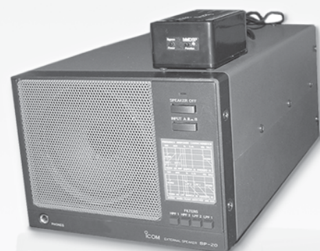
...on the top