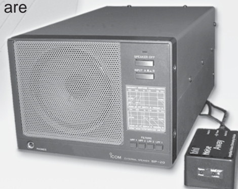
...on the desk

The ANEM is easy to set up using the 3.5mm mono plug lead provided. For ease of use the modules functions are controlled by a microprocessor, enabling simple operation via two pushbuttons: power on/off audio bypass and DSP filter on/off. There are 4 or 8 levels of noise cancellation, selected via the pushbuttons on power up, and the last selected filter level remains in the memory if the power is removed. The ANEM comes boxed with a Fused DC power lead (2.1mm) and a 3.5mm mono plug lead 1.2m long, plus full operating instructions. Audio adapters are available to suit different connections. Velcro strips are provided for mounting the module in a suitable position on your extension speaker or radio equipment.