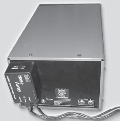
Fit it on the rear...

The module simply fits in-line between the communications equipment and the loudspeaker. The ANEM is suitable for a variety of applications but is particularly useful for improving voice quality in amateur radio, removing unwanted QRM and QRN to give much improved readability and speech intelligibility across all bands. You can listen more clearly on SSB, UHF, VHF, HF and FM.