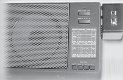
...on the side

The module simply fits in-line between the communications equipment and the loudspeaker. The ANEM is suitable for a variety of applications but is particularly useful for improving voice quality in amateur radio, removing unwanted QRM and QRN to give much improved readability and speech intelligibility across all bands. You can listen more clearly on SSB, UHF, VHF, HF and FM.